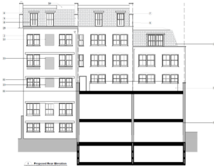
1 Proposed Rear Elevation 311: 1:50(A1) 1:100(A2)