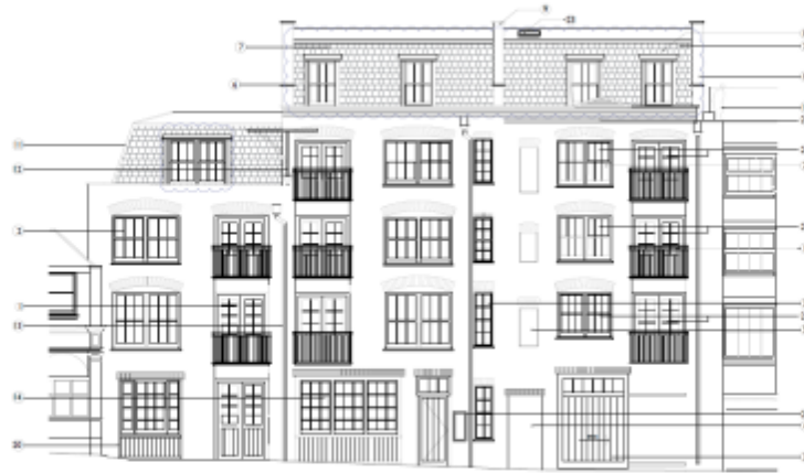
1 Proposed Front Elevation 311: 1:50(A1) 1:100(A2)