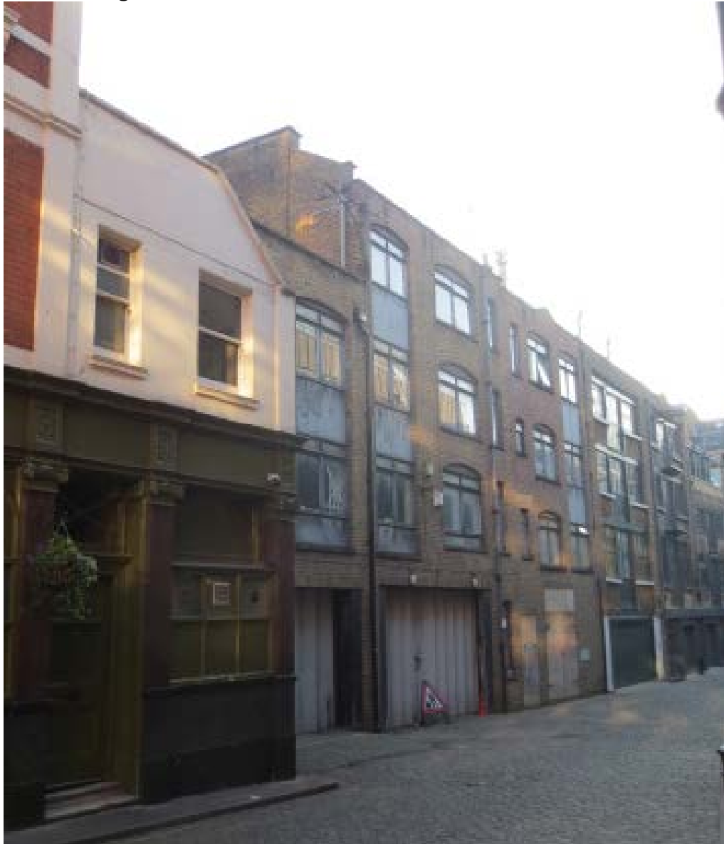
Photograph 1. Existing front elevation